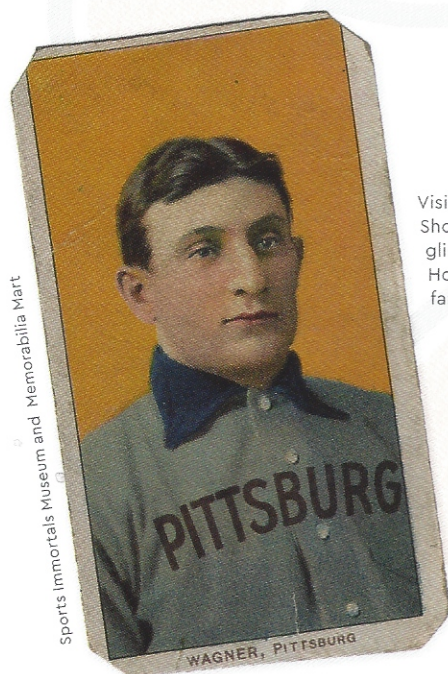
Visitors to the Sports Immortals Showcase Museum might get a glimpse of the legendary T206 Honus Wagner, baseball's most famous vintage card.

The largest room in the vault contains row upon row of blue security trunks, stacked atop another, each packed with the Crown Jewels of Sports. "In my collection everything has a story," Platt says. "Actually a couple of stories. There's the athlete's story, and