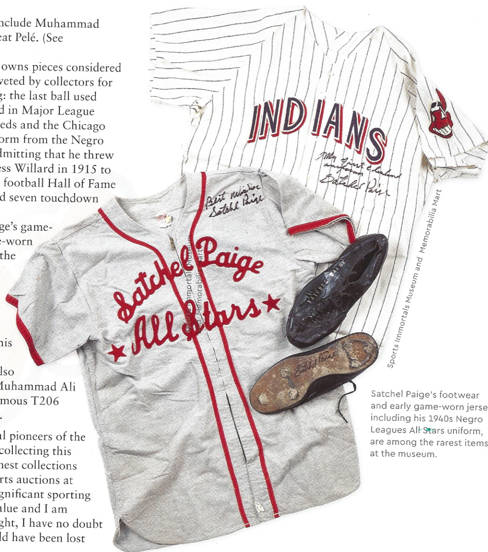
Satchel Paige's footwear and early game-worn jerseys, including his 1940s Negro Leagues All-Stars uniform, are among the rarest items at the museum.